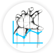
RISK MANAGEMENT & MITIGATION