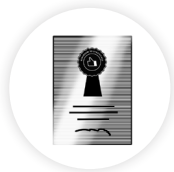
CERTIFICATE OF INSURANCE COMPLIANCE