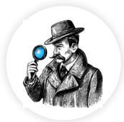
AI CLAIM COST PREDICTION